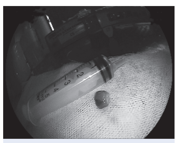
Figure 2. View of the excised polyp

A 51-year-old man was admitted to our hospital with dyspeptic symptoms for 3 months prior to admission. On admission, the patient's physical examination and routine laboratory tests were normal. Endoscopy revealed a pedunculated polyp the size of 15 mm in the postbulbar duodenum (Figure 1). The polyp was successfully removed with endoscopic polypectomy following injection therapy with 1:10000 adrenaline solution (Figure 2). The final histopathological diagnosis of this polyp was BGA (Figure 3).